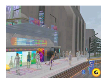
Early screenshot of Second Miltia city (unknown date)

One can perhaps conclude from this that the cutscenes were not developed chronologically, and so there wouldn't necessarily exist a full "Episode II"-like game on Episode I's engine at this time. More evidence of this is suggested from what was revealed during a Xenoblade Chronicles interview in 2010, where it was stated that MonolithSoft's approach is to develop games by "starting from a broad, thin base and building on it over time." Though, we do know that beta screenshots from Second Miltia in the original Episode I were shown on the net.