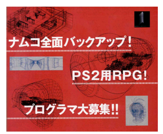
MonolithSoft's work advertisement (2000)