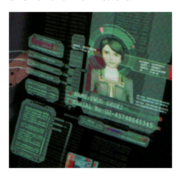
Vwud Uzuki screenshot, from pre-order art book (2002)

Furthermore, a pre-order art book for Episode I showed a Realian tank onboard Proto Merkabah that was apparently removed from the game. A Realian called "Vwud Uzuki" was in the tank, featuring a U-TIC outfit that would not be seen until Episode III when Shion and Allen wears it.