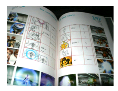
Episode I storyboards (Xenosaga -Official Design Materials-)

Saga stated that when plotting "I usually come up with the ending first then details follow." (screen) But either way Takahashi probably kept an overview of the parts of the script, as well as the backstory and timeline, while writing the story and screenplay together with Soraya Saga. The complete screenplay for Shion's arc would be finished in first draft before October 2002, since that was the time of Soraya Saga's last contribution to the Xenosaga project.