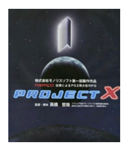
Monolith Soft's "Project X" promotional poster (2000)

Presumably the X in " Project X " was always symbolic of the Xeno - prefix, and that Tetsuya Takahashi intended to name it something as close to " Xenogears " as possible. It probably did not take long for Takahashi to settle on the " Xenosaga " title. "We created Monolith Soft in October 1999. At the same time, we began development on ' Xenosaga .' Or, that is what I'd like to say, but in the beginning we were scrambling to bring together talented people," says Takahashi in the December 2001 issue of Dengeki PS2 . "So in actual fact, development began sometime around the end of 2000."